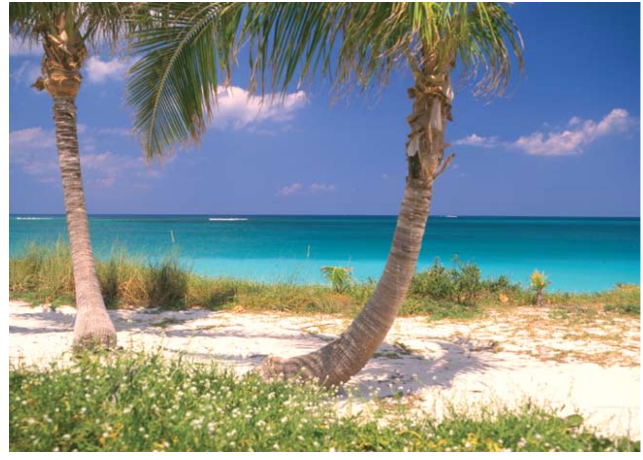
Waves crashing on the inner and outer reef protect Long Bay Beach from storms.

everal times a year, Lee LaPointe of Vero Beach goes home across the Gulf Stream to a special island in the sun; back to a tranquil place of childhood memories on an ocean beach, where the surf crashes in from the world's third largest barrier reef, the sun rises with soft glowing rays and the full moon comes up like it's on fire.